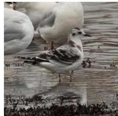
Little Gull