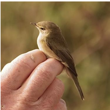
Chiffchaff