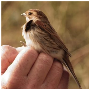
Reed Bunting