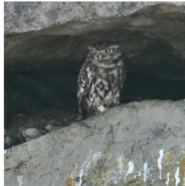
Rock Pipit and Little Owl by Ian West