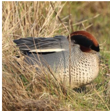
Ruff and Teal