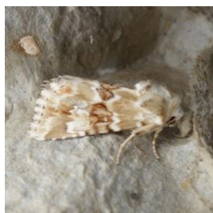
Dusky Sallow and Bright-line Brown-eye