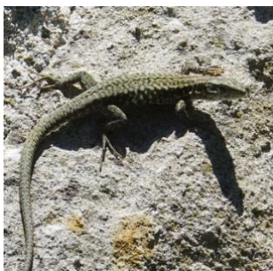
Wall Lizard and Grayling