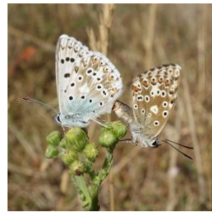
Chalkhill Blues