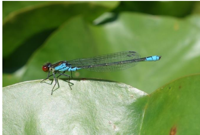
Small Red-eyed Damselfly

Friday July 13th – Sunday July 15th 2018