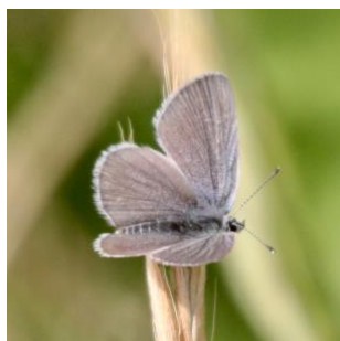
Small Blue by Liz Taylor

Next we walked out to the Westcliffs where we saw a pleasing selection of seabirds including Gannet, Shag, Kittiwake and Guillemot. A single Rock Pipit was seen feeding on the clifftop and behind us over the meadow a young Kestrel pursued one of its parents, begging for food. Walking back to the van we found some very fresh Small Blues, several of which allowed us prolonged and close views.