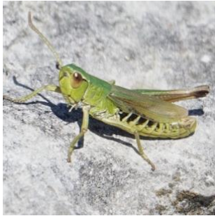
Common Green Grasshopper and Clouded Yellow by Jeremy Aldred

We parked near the Georgian monstrosity of St George's Church (built to replace St Andrew's) and walked past Bower's Quarry to the Westcliffs, seeing a very smart Comma and a Clouded Yellow on the way. Reaching the plateau near the cliffs we found that there had been a major emergence of Chalkhill Blues that morning, with enormous numbers of them swarming over the grasses everywhere we looked. Probably even more surprising though was a very fresh male Silver-studded Blue, which as we watched it was joined by a much older female. Looking out over the cliffs we could see a nesting colony of Fulmars and a couple of young Ravens perched together on the vertical rock-face. A Hummingbird Hawkmoth was another delightful find at what was probably the best site of the weekend.