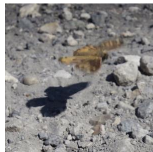
Grayling (record shot!)