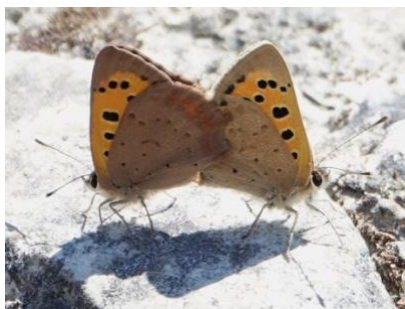
Small Coppers and Lulworth Skipper by Jeremy Aldred

One of the most productive sites of the day with several Chalkhill Blues found in an area of outstanding wild-flower meadows. A pair of mating Small Coppers were also very much enjoyed as they posed on the path just in front of us. As well as the butterflies the area was swarming with Six-spot Burnet Moths.