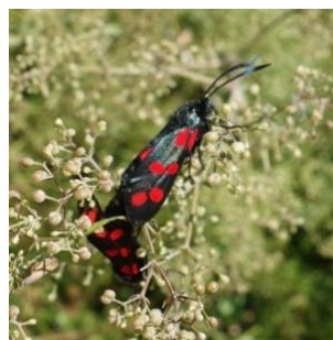
Six-spot Burnets