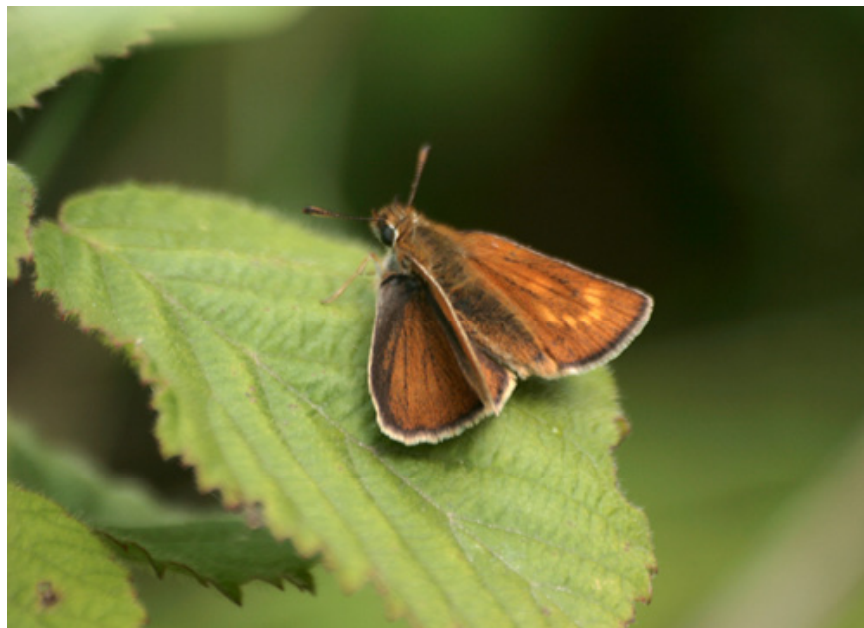
Lulworth Skipper, Southwell 18 June 2011