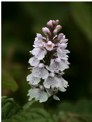
Heath Spotted Orchid

Pea Family: Birdsfoot Trefoil Bush Vetch Common Vetch Dyer's Greenweed European Gorse Everlasting Pea Greater Birdsfoot Trefoil Hairy Tare Haresfoot Clover Hop Trefoil Horseshoe Vetch Kidney Vetch Lesser Trefoil Meadow Vetchling Red Clover Restharrow Rough Clover Sea Pea Tall Melilot Tufted Vetch White Clover