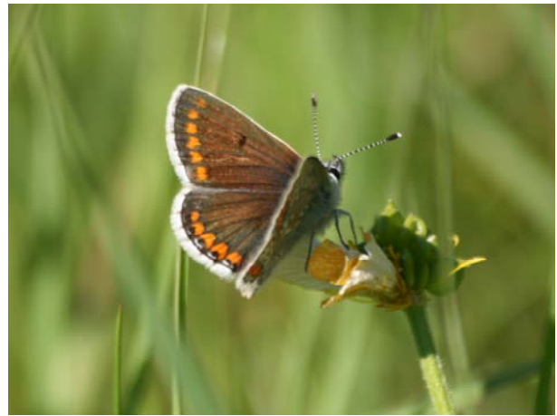
Brown Argus at Durlston

The Middlebere Heath path failed to produce any Dartford Warblers but we did see a family of Stonechats and had a very pleasant lunch overlooking Poole Harbour. Several Yellow-legged Gulls were marauding around the mudflats here and some distant Buzzards made up for the general lack of raptors over the weekend. From a viewpoint overlooking Middlebere Lake we saw some distant Redshank and a flying Little Egret.