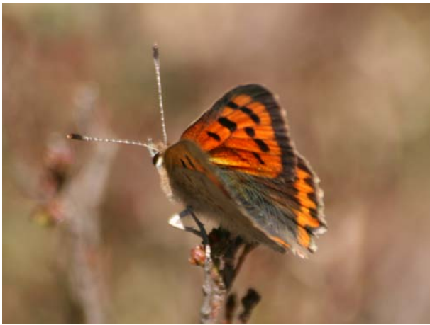
Small Copper at Arne