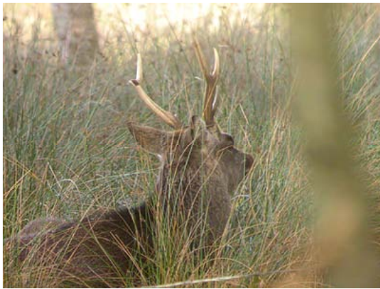
Stag Sika Deer (digiscoped)

In gorgeous weather conditions we greatly enjoyed our walk around one of the RSPB's top reserves. Our main target, Dartford Warblers, took a while to find but our perseverance was rewarded with mostly distant views of at least 10 individuals, including at least one adult male. Middlebere Lake held huge flocks of Black-tailed Godwits and Teal, with good numbers of Lapwings and Wigeon as well. Several Pintail were seen along with a couple of Yellow-legged Gulls and plenty of Curlew. The other side of the reserve produced a few Bramblings as well as most of the usual woodland birds including 5 species of thrush, Nuthatch and both woodpeckers.